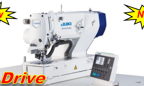
Computer Controlled, High Speed Button Hole Sewing Machine