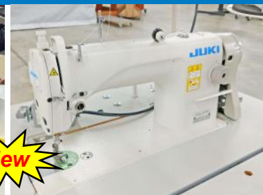
Juki Model DLN-9010AS Single Needle Needle Feed Fully Automatic