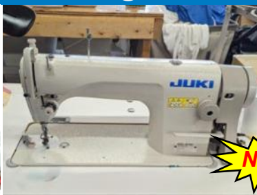
Juki Model DDL-8700 Single Needle Lockstitch Manual Functions