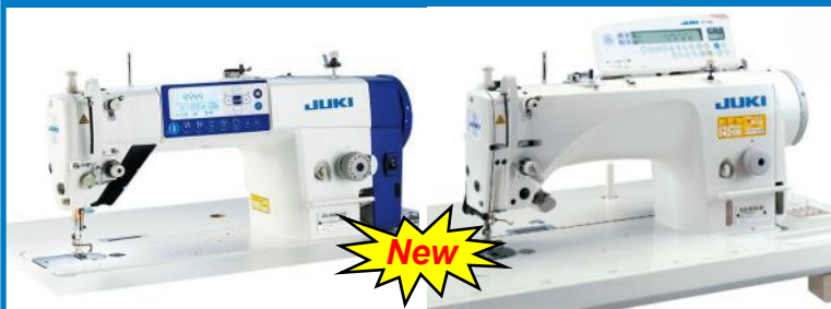
Juki Model DDL-8000A Single Needle Lockstitch Fully Automatic, Direct Drive