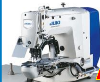
Computer Controlled, High Speed Bar Tack Sewing Machine