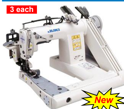
Juki Model MS-1261MF/V0455

3 Needle Chainstitch Feed Off the Arm Sewing Machine For Extra Heavy Duty Denim and Workwear Includes Steel Puller