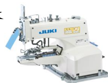
Juki Model MB-1373 Single Thread Chainstitch Button Sewing Machine

Complete with Table, Stand, and 220 volt motor